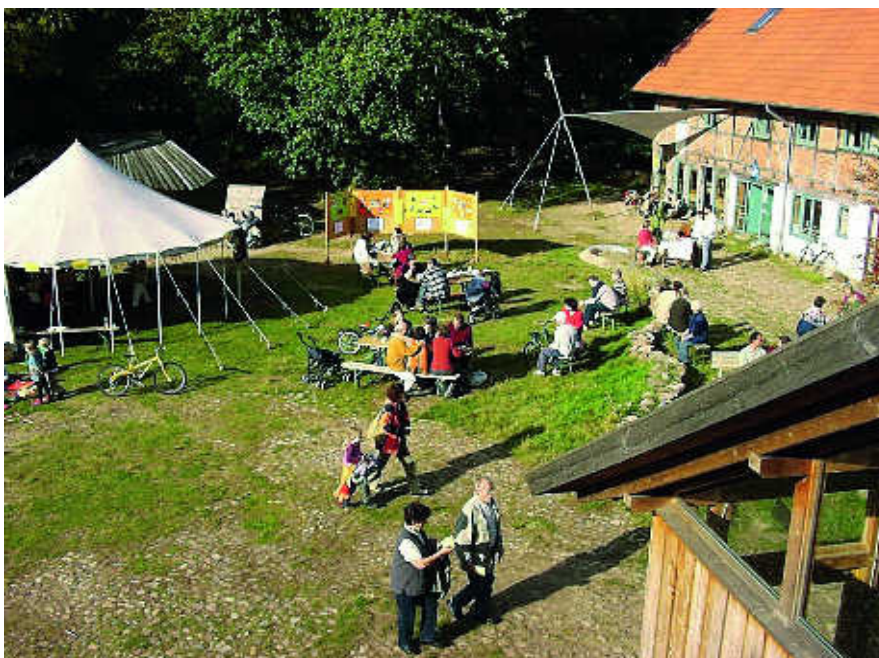
A lifestyle choice at Sieben Linden

Hewlett-Packard (HP), which makes lots of electronic devices that are subject to such rules, says it welcomes them. It has always tried to design its products not just from cradle to grave, a spokesman explains, but from cradle to cradle—meaning with recycling in mind. Its laptops are 90% recyclable and its printers at least 70%. By last year HP had recycled over 450,000 tonnes of used equipment. It aims to double that figure by the end of next year. At its facility in Roseville, California, workers first check discarded computers and print-