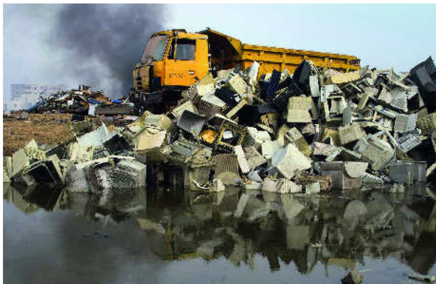
Not as clean as it looks

► Oroya, Peru, where poorly managed effluent from 80 years of mining and smelting has left local children with three times more lead in their blood than the World Health Organisation's recommended maximum; and Dzerzhinsk, Russia, where 300,000 tonnes of chemical waste were disposed of haphazardly, mostly in Soviet times. Life expectancy in the city is 42 years for men and 47 for women.