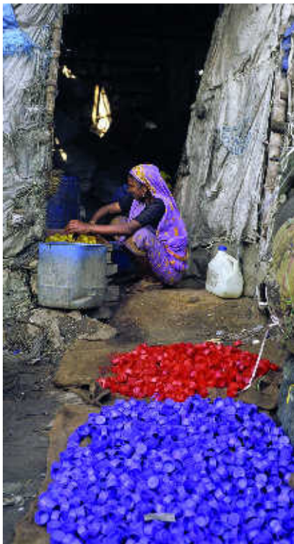
It's a job

Another woman comes in, carrying a load of plastic bottles several times her own size on her head. She will sort it by type of plastic and by colour. In another part of the shed a third woman stands