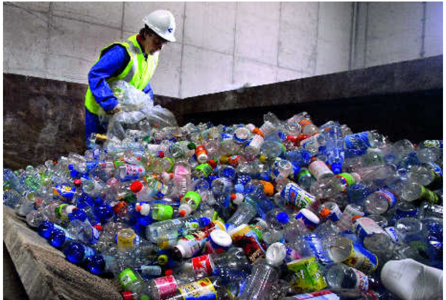
From bottle to bottle

The shortfall is covered by Norcal’s customers, who pay about $25 a month for waste disposal. Whether that price is worth paying is a complicated question. The answer depends, among other things, on the cost of alternative disposal methods and the value ascribed to the environmental benefits. At the most basic level, recycling competes with landfilling. That is