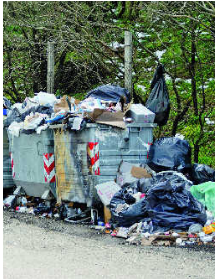
It doesn't have to be like this

A desire to reduce the amount of waste being produced and to minimise the harm it does is all well and good, but governments must be sure to encourage those ends by the cheapest and most efficient means. Plugging loopholes in the rules is a good first step. American officials should be much stricter about coal-ash tips, regardless of how much clout utilities have